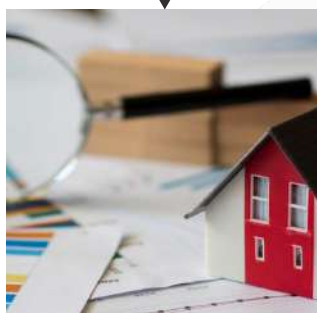
3C. RENTAL ASSESSMENT STUDIES