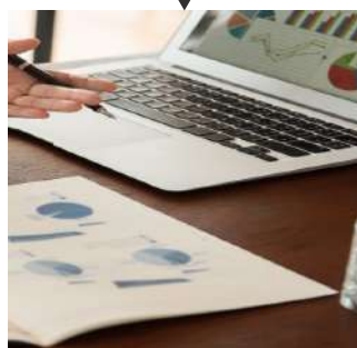
3B. DEVELOPMENT APPRAISALS