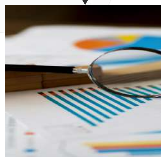
3D. MARKET RESEARCH