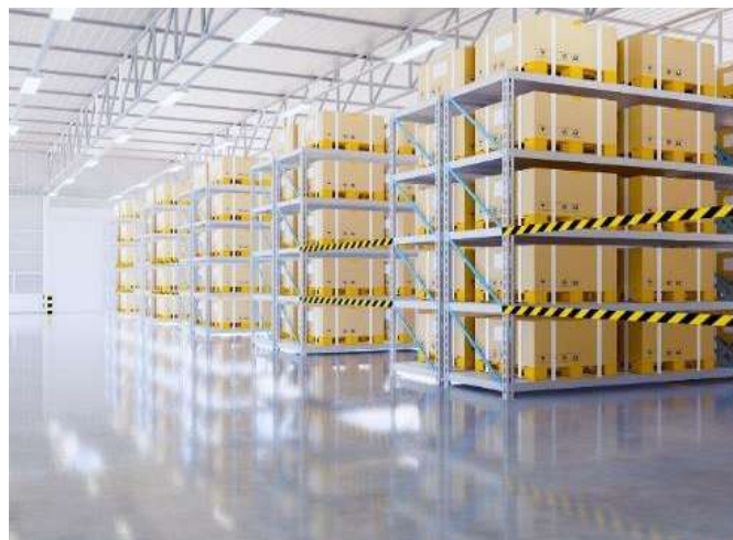
2. COMMERCIAL VALUATIONS