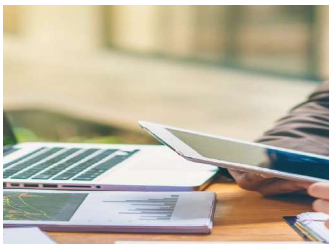
3. STRATEGIC CONSULTING & ADVISORY SERVICES