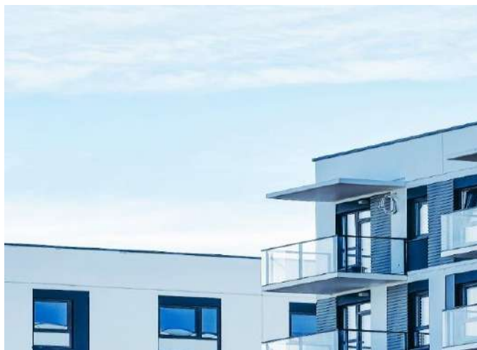
1. RESIDENTIAL VALUATIONS