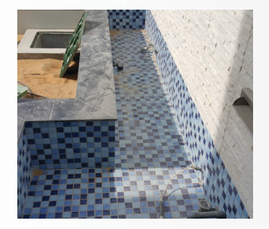
INCOMPLETE WATER FEATURE

Realpoint Real Estate Consultancy provides Complete Snagging Reports of buildings and villa communities to assist Property Developers achieve smooth handing over of units by confirming the work completion by the Contractor with adequate quality of workmanship.